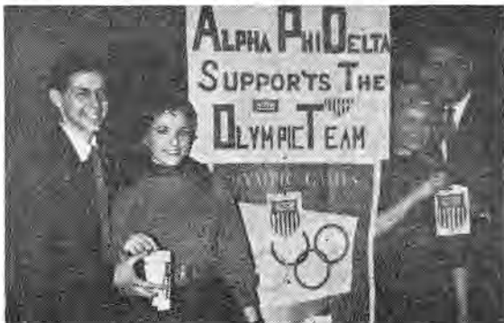
Right: Pledges of Beta Delta collecting money from coeds for the Olympic Teams at Temple University.