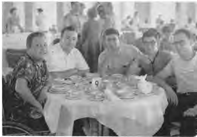
Beta Eta alumni and undergraduates at the 36th Annual Convention.