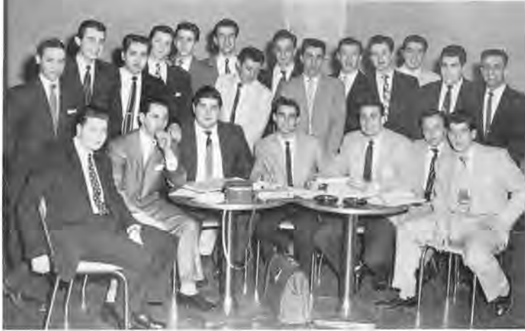
Some of the Brothers of Beta Mu, who helped make it this year's most outstanding chapter.