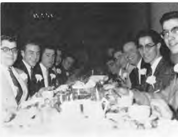
Members of Beta Theta Chapter, this year's most improved chapter, at its First Annual Appreciation Banquet.