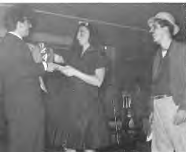
Pledges farce their way through a skit at the 3rd District Annual Pledge Smoker. The Delta pledges show here above came close but Beta Eta took the prize.