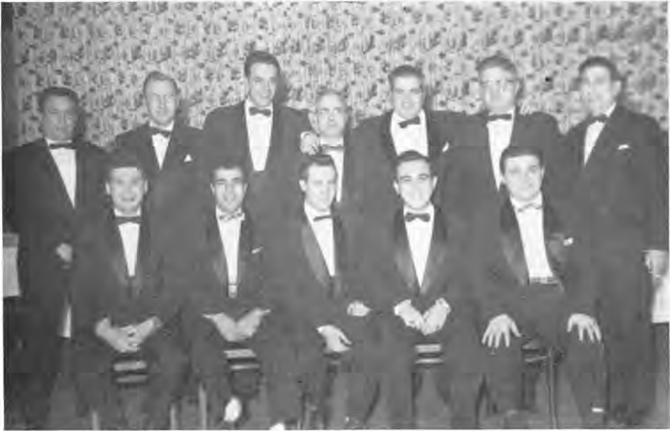
National, District, Alumni and Chapter Officers at Beta Iota's Purple and White Dinner Dance.