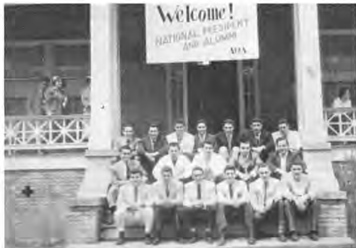
An en-masse welcoming committee of Chi Brothers in front of the Chi Chapter House.

Despite the fact that Epsilon Chapter has been very active socially, there have been no adverse effects scholastically. On the contrary, the Chapter has shown amazing progress in rising from 13th to 2nd scholastic position on the campus in one year. It is this achievement along with the other advances they have made of which Epsilon Chapter is particularly proud. And they make no bones about their feeling that they will be strong contenders for chapter awards at Convention time this year.