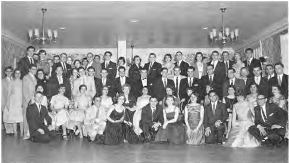
Alumni and undergraduates turn out for Founder's Day at Chi.

Chi has one of the biggest pledge classes in recent years this year, totaling twelve boys; the house is operating at full capacity—34 members.